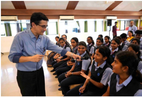
Orientation programme by Indian Academy of Pediatricians conducted on 2nd November 2023