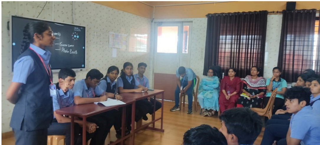
Brain Storming Sessions