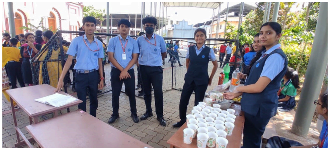
Lemonade stalls and photo booth during Onam Celebration (fund raiser) conducted on 23th August 2023