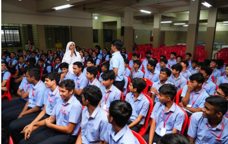
Inauguration of Right Turn Club conducted on 17th August, 2023