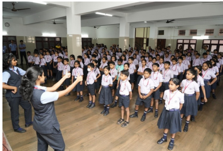
Awareness programme (skit) on healthy eating habits by club members for grade III and IV students conducted on 27th February 2024