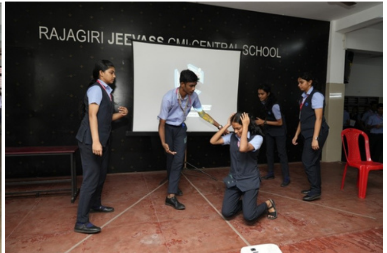
Awareness programme (skit) on healthy eating habits by club members for grade V,VI and VII students, conducted on 26th February 2024