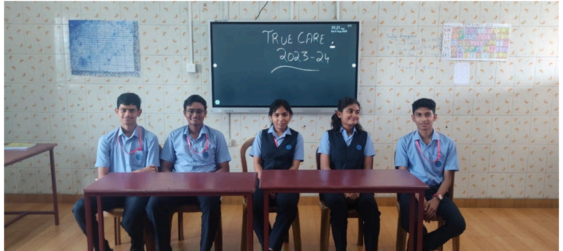
Regular Club Meetings