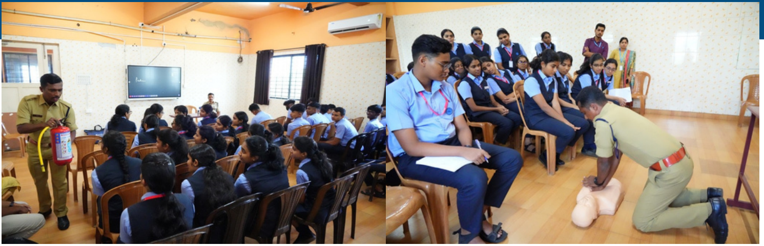
Awareness programme by Fire and Rescue Department, Aluva conducted on 28th October 2023