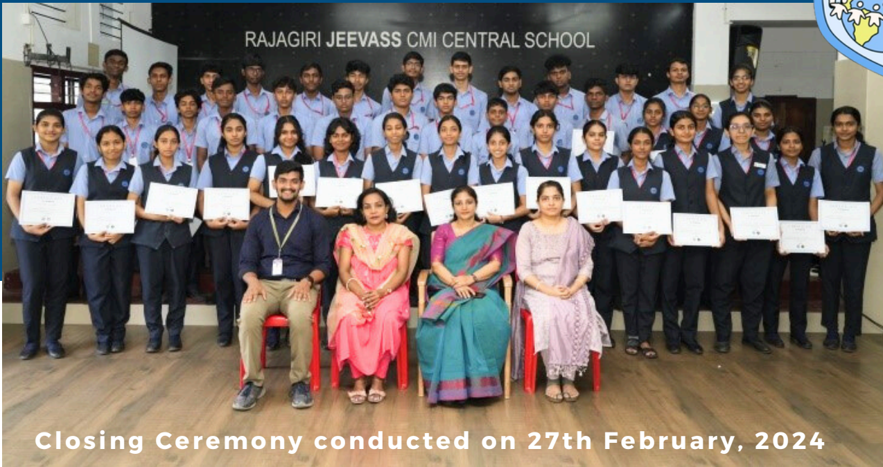
Closing Ceremony conducted on 27th February, 2024