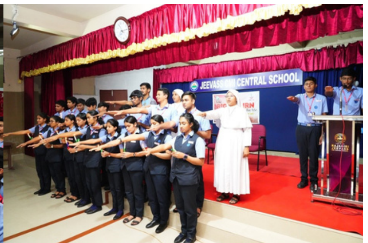
Awareness programme by Right Turn Club on substance abuse and addiction conducted on 17th August, 2023