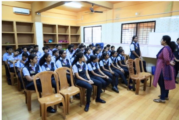
Students sharing their experience about the I.I.M.U.N Conference attended on 5,6,7 January 2024 in Choice school, Thripunithara.