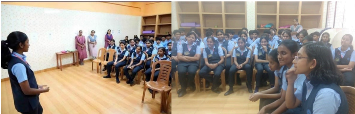
Debate and Closing ceremony of MUN on 22 February 2024.