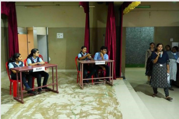
Quiz on Kerala Piravi conducted on 1st November 2023