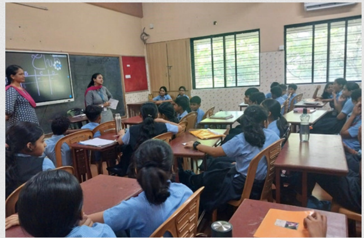
Quiz on the History of Kerala conducted on 22nd February 2024