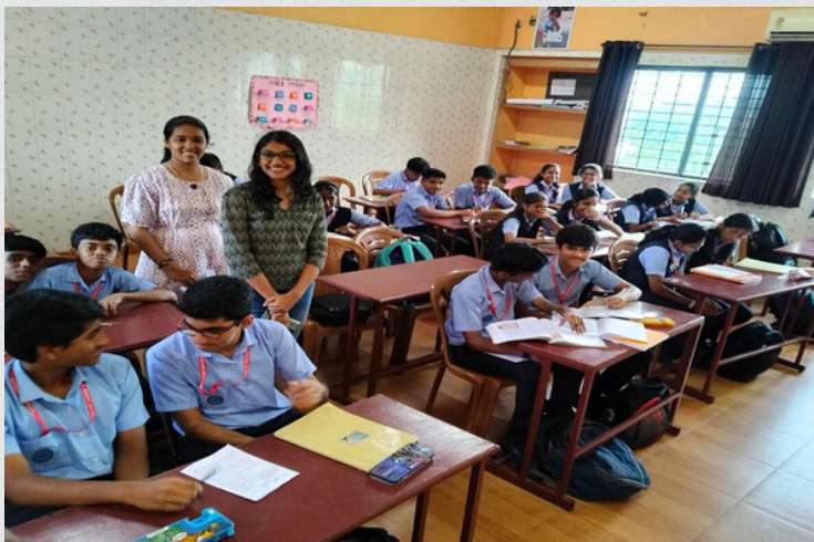
Samasya Quiz competition conducted by NIT, Calicut on 17th November 2023