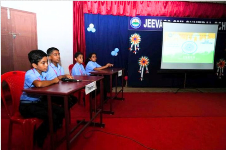
Independence day quiz competition conducted on 14th August 2023