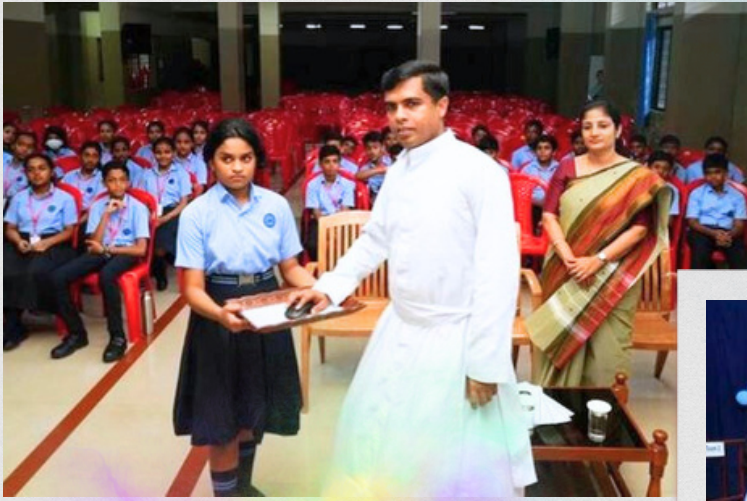
Quiz Club Inauguration Date : 18th August 2023 Time : 1.00pm – 2.00pm Venue : Auditorium