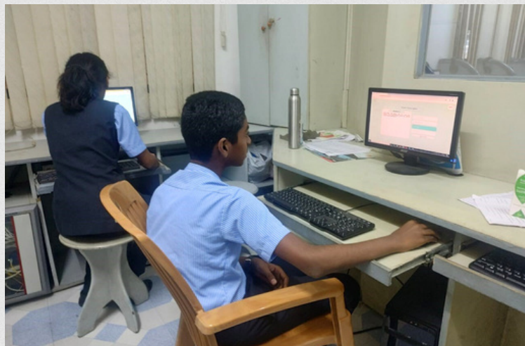
Quiz conducted by Rohan's Books publication on 19th January 2024