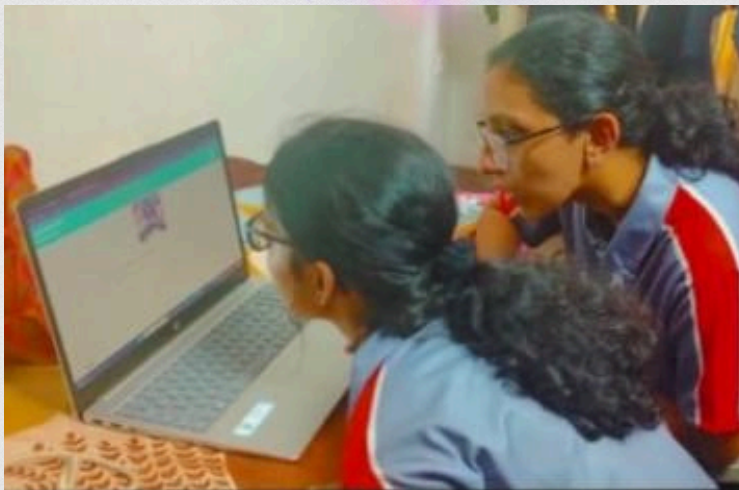
NDA Wizquiz conducted by National Defence Academy on 12th August 2023