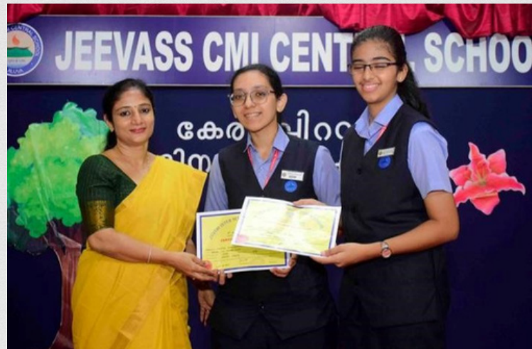
Winners of Quizadilla competition conducted by Jyothi Nivas Public School, Aluva on 30th September 2023